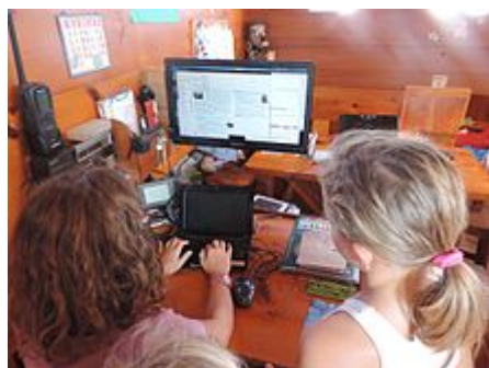
Reading Wikipedia through Kiwix on a boat in the South Pacific . [20]

Since 2014, most Wikipedia versions are available for download in various different languages. [17] The project was unable to produce up-to-date complete versions of English Wikipedia after October 2018 but started making releases again in July 2020. [22]