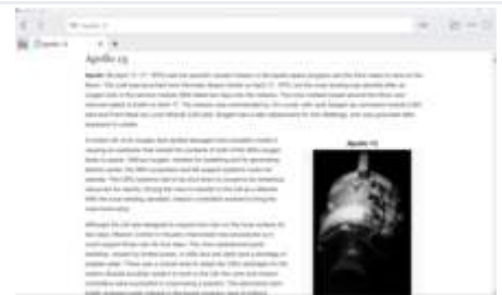
Kiwix 2.3.1 running on Windows 11