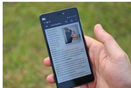
Medical Wikipedia app on a smartphone

Kiwix is available on Debian [52] and Debian-based distributions, such as Ubuntu [53] and Linux Mint , Fedora [54] and other RPM-based distributions, such as openSUSE , [55] and on the Sugar , Arch Linux , [56] and NixOS [57] distributions. A distribution-independent Flatpak version is also available. [58] It is also available on Android . Kiwix JS UWP and Electron packages are available in the native Windows package manager winget .