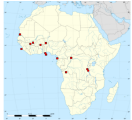
Carte des point d'accès à Wikipédia hors-ligne (plugs ou intranets) Locations of 13 universities in 11 countries where Kiwix was deployed as part of the Afrimedia Project