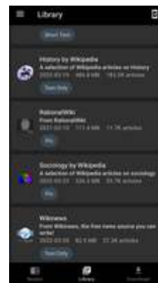
Kiwix Android App

Besides Wikipedia, content from the Wikimedia Foundation such as Wikisource , Wikiquote , Wikivoyage , Wikibooks , and Wikiversity are also available for offline viewing in various different languages. [23]