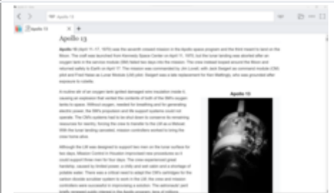
Kiwix 2.3.1 running on Windows 11