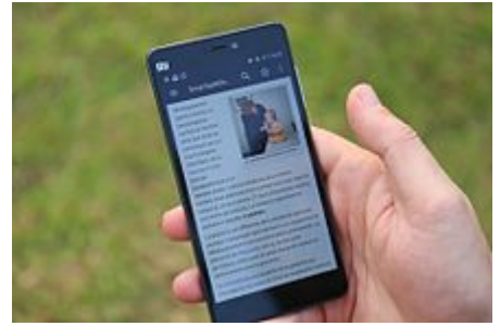
Medical Wikipedia app on a smartphone

Kiwix is available on Debian [52] and Debian-based distributions, such as Ubuntu [53] and Linux Mint , Fedora [54] and other RPM-based distributions, such as openSUSE , [55] and on the Sugar , Arch Linux , [56] and NixOS [57] distributions. A distribution-independent Flatpak version is also available. [58] It is also available on Android . Kiwix JS UWP and Electron packages are available in the native Windows package manager winget .